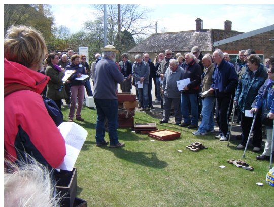
Bidding is brisk at the 2013 event

If you have surplus BEEKEEPING EQUIPMENT you wish to sell an Entry Form is attached to this newsletter or can be downloaded from the West Sussex BKA website. It can also be requested from the event organiser. Closing date for entries is 16 th April, but please do not delay in registering your lots .