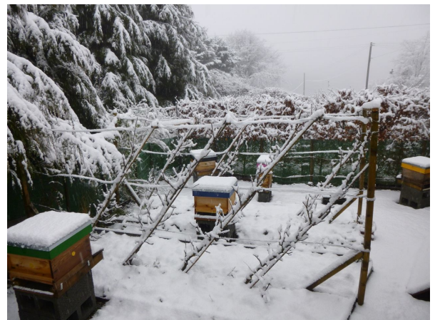
A snowy scene in Wales on 11 th February 2014

We all know how difficult it is for beekeepers to go away on holiday during the summer, so in mid February we took a short break and went to visit the satellite apiary (and the friends). They all seem to be in good order. Overnight on 10 th -11 th February there was a significant fall of snow, and the one sad thing was to see, on the bright sunny morning of 11 th , that a number of bees had clearly been tempted out by the high light intensity, and were dotted about the garden dead, little black dots in the white, some in depressions up to a centimetre deep where it would seem their residual body heat had melted the snow a little.